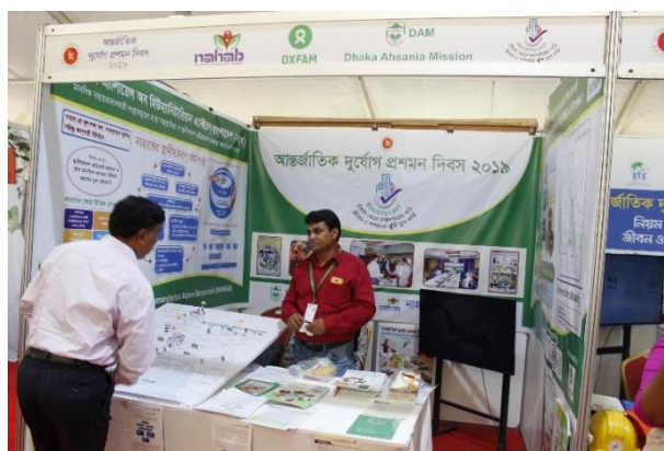
IDDR-2019 Stall at BICC. Visitor asking about the NAHAB and ELNHA.

The International Day for Disaster Risk Reduction was started in 1989 and celebrated worldwide, Bangladesh is one of them. The IDDR-2019 has celebrated on 13 th October 2019 and on behalf of Bangladesh Ministry of Disaster Management and Relief (MoDMR) executed the event at Bangabandhu International Conference Centre (BICC). The event is inaugurated by the Honorable Prime Minister of Bangladesh, Sheikh Hasina, MP. The theme of this year is “নিয়ম মেনে অবকাঠামো গড়ি, জীবন ও সম্পদের ঝুঁকি হ্রাস করি” and in English “ Build to Last ”.